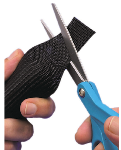
Clean Cut cuts easily and neatly with regular scissors and maintains a fray resistant end during installation.