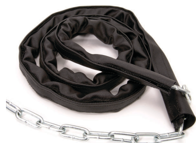
DW protects chains from harsh environments, as well as protecting wood or finished surfaces from scuffing and other damage.