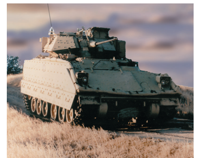
NM's qualities make it a viable choice for defense and military applications that call for flexibility, strength and full coverage protection.