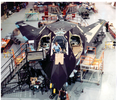
Flame resistance, strength and low weight make Ryton sleeving the first choice in high-