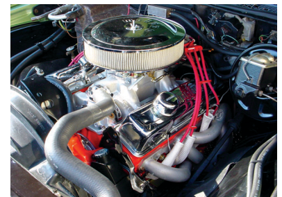
Insultherm Spark Plug Boot Sleeves can rest directly on hot headers and other engine components without burning, melting or becoming brittle.

Insultherm Spark Plug Boot Sleeves are available in retail packaging as part of Techflex's exclusive "Double Yellow" performance products line.