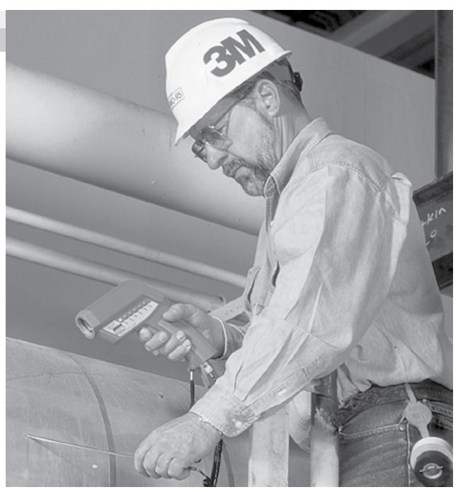
3M™ Infrared Thermometer Model IR-60EXPL2