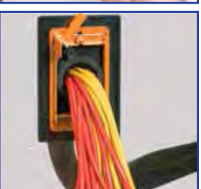
Super Strong Strain Relief For Your Wires