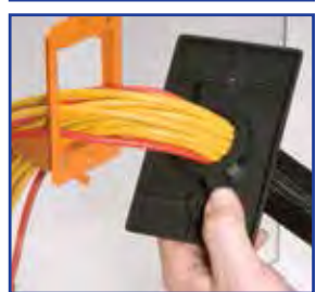
Fits In Single Gang Wall Box