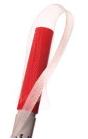
1/4" Flexo Thin's enormous expandability allows the management of large bundles of very fine wiring and optical cables.