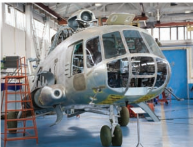
Clean Cut FR is a common harness material for both military and civilian aircraft.

The combination of flame retardance, ease of installation, and nearly complete coverage makes Clean Cut FR an ideal solution for many industrial and advanced engineering applications.