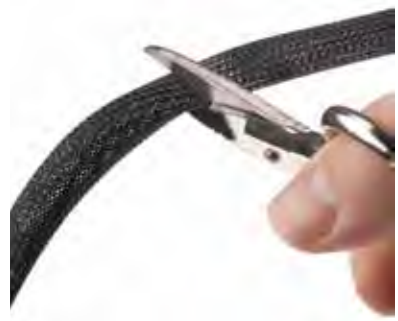
Clean Cut cuts easily and neatly with regular scissors and maintains a fray resistant end during installation.