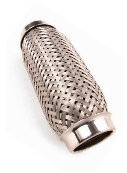
Stainless Steel sleeving is used in applications such as expansion joints, where constant movement and high temperatures require a flexible, indestructible covering.

STAINLESS STEEL (SSN) braid looks great in any application and is as strong as steel. Now, you can take any stock or custom hose, slip a length of Flexo Stainless over it, hide the cut ends under your clamps and have the same look and protection as custom overbraided hoses at a fraction of the cost. Braided Stainless Steel sleeving is used in applications where constant movement and high temperatures require a flexible, indestructible covering. Extremely high melt temperature makes this a great sleeving for automotive applications. Superior abrasion, chemical, and UV resistance make it great for outdoor applications.