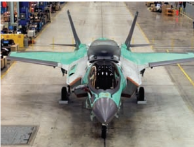
Halar's® low outgassing, as well as its heat, chemical, and radiation properties, make it ideal for use as a component in technologically advanced applications.