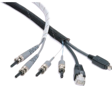
Many telecommunications companies rely on Flexo Halar® for their plenum wiring systems.