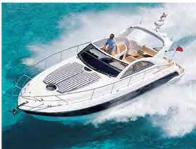
Flexo HWN quickly dries when exposed to moisture making it ideal for marine applications.