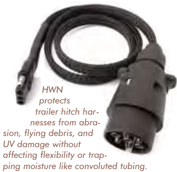
HWN protects trailer hitch harnesses from abrasion, flying debris, and UV damage without affecting flexibility or trapping moisture like convoluted tubing.