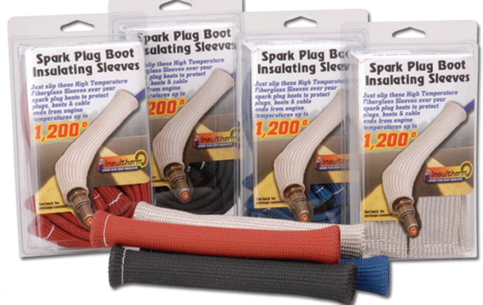
See pg. 105 for the custom kits.