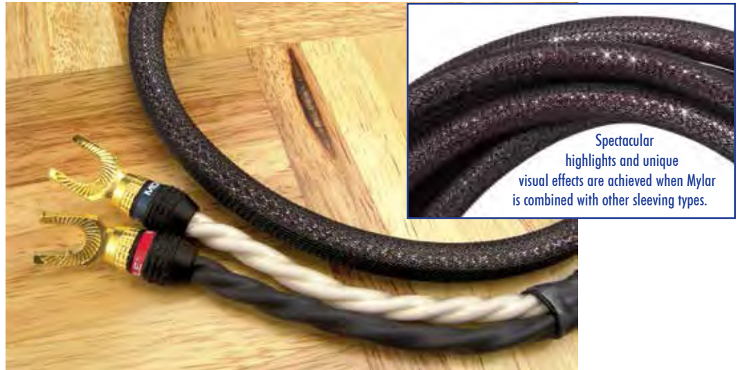
Spectacular highlights and unique visual effects are achieved when Mylar is combined with other sleeving types.