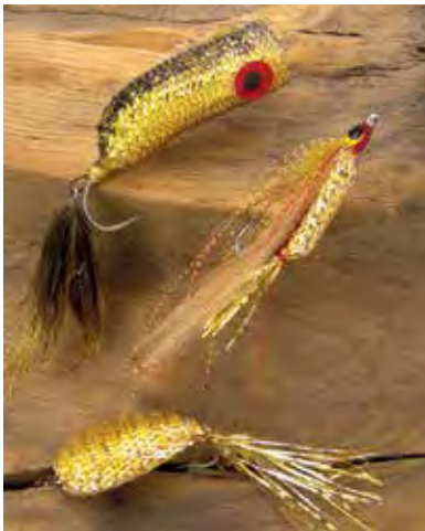
Light weight and economical make MYN an ideal product for designing and tying fishing lures of all types and sizes. Several world records have been set with lures constructed with Techflex sleeving.